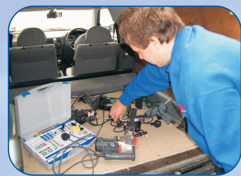
ULTRA PORTABLE USE ANYWHERE