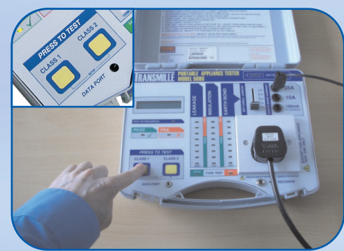
1 BUTTON OPERATION :: 20S TEST TIME