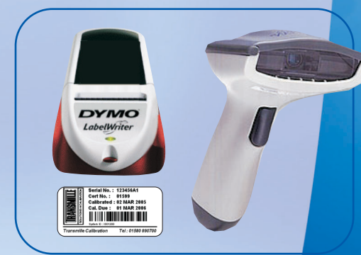
LABEL PRINTING (PC) - BARCODE SCANNING