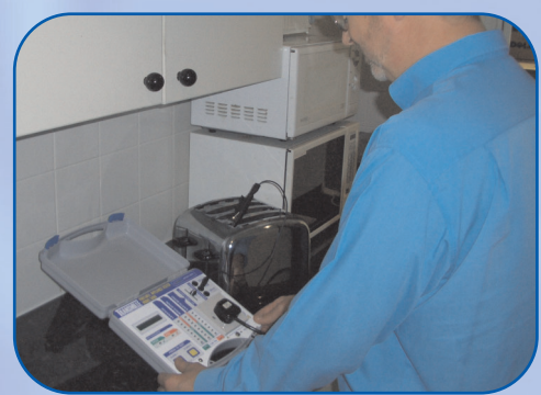
FASTER TESTING - LESS DOWNTIME